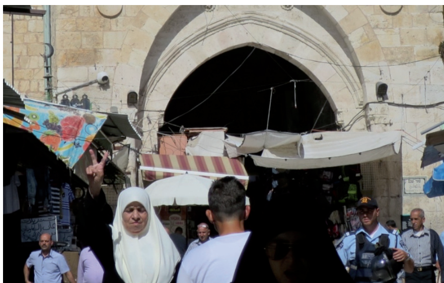
People and Israeli Security forces inside Damascus Gate

Amid continued political impasses over the past 20 years, what have been the spatial trajectories of change in Jerusalem? How has the city under partisan occupation evolved spatially, politically, psychologically, and economically? Based on field research in 1994 and more recently from October 2015 to February 2016, here is what I have observed.