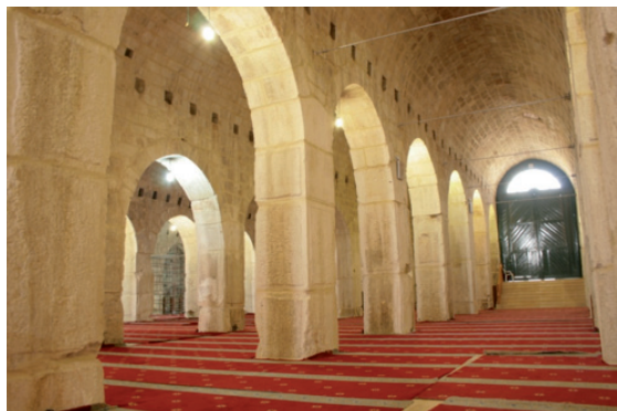
Al-Marwani Mosque-View from inside

Israeli opposition, involving running battles with the police, legal petitions by pressure groups, and critical reports by the Israeli Antiquities Authority. 1 Nevertheless, the rehabilitation work greatly enhanced the standing of both the Islamic Movement and the Waqf Administration in the Islamic world. 2