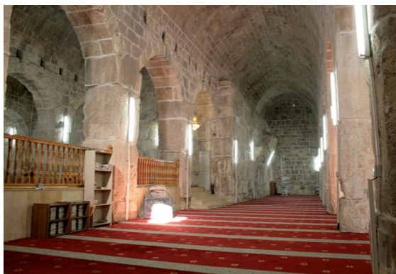
Al-Marwani Mosque-View from inside

In the midst of recent tensions and controversies surrounding the access of non-Muslims to the Haram al-Sharif, observers and researchers may have overlooked the significance of a remarkable achievement that has occurred in Jerusalem: the restoration and rehabilitation of Mussala al-Marwani, or the Marwani