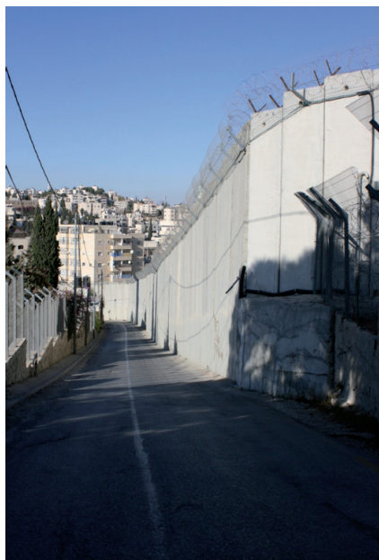
Separation wall, separating Ras Al-Amud from Abu Dis

complexities and contradictions into the urban landscape that are not consistent with Israeli political objectives.