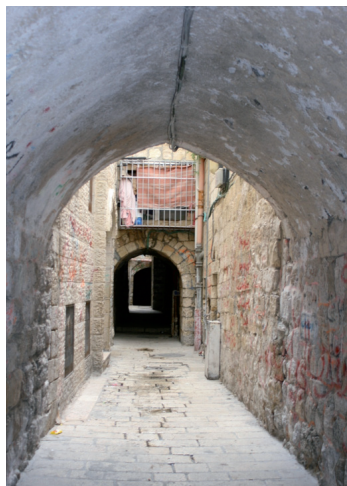
An Alley in the old city of Jerusalem

A band of itinerant musicians and dancers hired by a Persian king? A caste of entertainers, commissioned to defend their homeland against a Hunnish invasion in the 5 th century? Or a number of tribes sent out to Persia to a Turko-Persian general, never to return again? How and when did the Gypsies begin their migration, and how did they end up in Jerusalem of all places? In the early 18 th century, historians established that the Gypsy people originated as a caste of entertainers in India who called themselves Dom, which meant “man” in their common language. The Dom of Jerusalem are one of the many communities of Gypsies who have settled throughout the Middle East. Like the Roma and Lom, their European and Armenian counterparts, the Dom have a consciousness that is both uniquely Gypsy