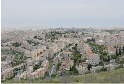
The Israeli Settlement of Pisgat Zeev

There are plans in Arab East Jerusalem that are theoretically meant to guide development, but they are used by Israeli authorities instead to restrict and control, with constraints on outward growth (blue lines), open space, and future urbanizing designations, and restrictions on building volume. Further hindrances to Palestinian