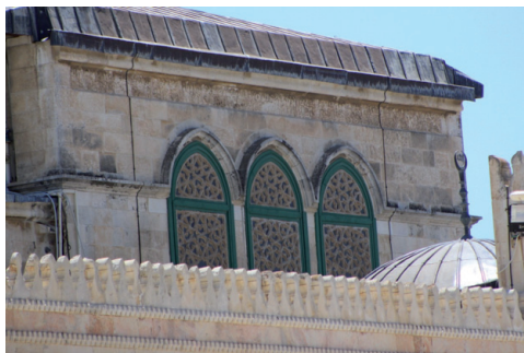
Fatimid Engraving.

This article aims to investigate whether the Fāṭimids played a role in adding new constructions in Jerusalem or in affecting its intellectual and social life. The researcher consulted historical sources to determine whether the Fāṭimids had erected new institutions or contributed to Jerusalem's cultural activities. Before tackling the issue of contributions, this paper will begin